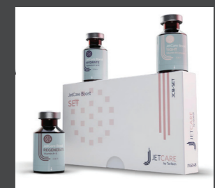
JETCARE BOOST SERIES