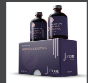
RENEWAL CARE SERIES