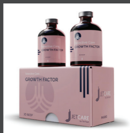
SELECTIVE CARE SERIES