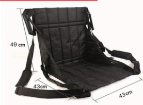
Portable transfer seat