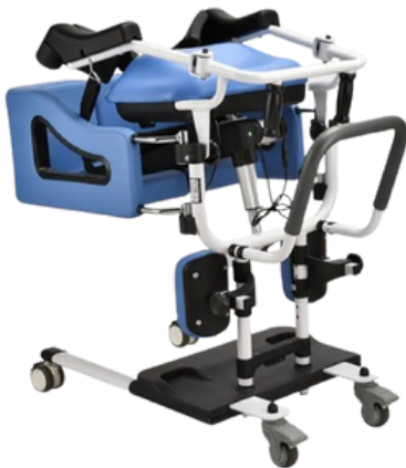
Patient Transfer machine (Electric )